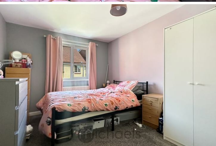
13' 10" x 9' 0" (4.22m x 2.74m) UPVC window to front aspect, radiator, built in wardrobes, radiator.