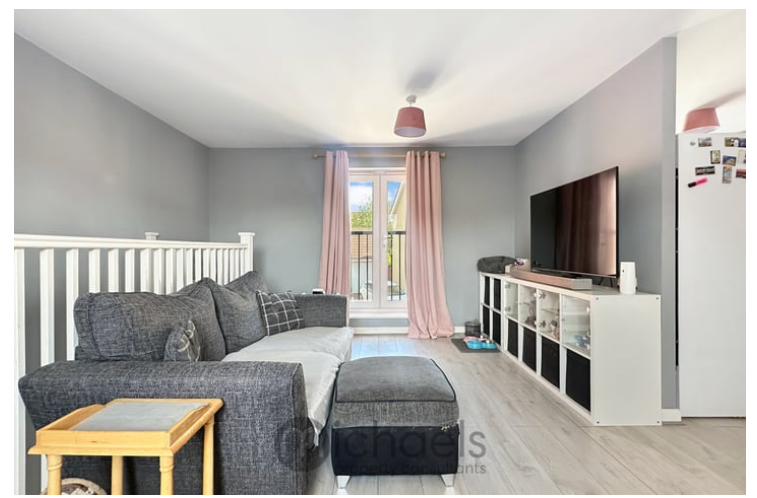
16' 1" x 13' 2" (4.90m x 4.01m) UPVC window to front and rear aspect, Juliette balcony, radiator, wood effect laminate flooring.