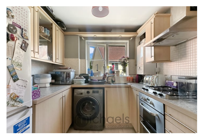
10' 0" x 7' 2" (3.05m x 2.18m) UPVC window to front aspect, range of matching eye level units, cupboards and work surfaces, electric fan assisted oven with gas hob, tiled splash back, wood effect laminate flooring.