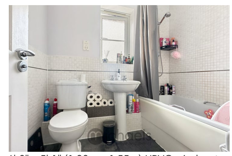
6' 0" x 5' 1" (1.83m x 1.55m) UPVC window to rear aspect, low level W.C, panelled bath with shower over, vanity wash basin, tiled walls.