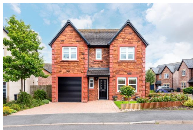
FRONT OF THE PROPERTY