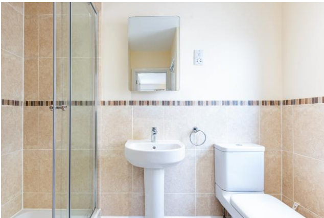
BEDROOM 1 & EN-SUITE

BEDROOM 2 (12'7 x 10') Double glazed window to the rear and radiator.