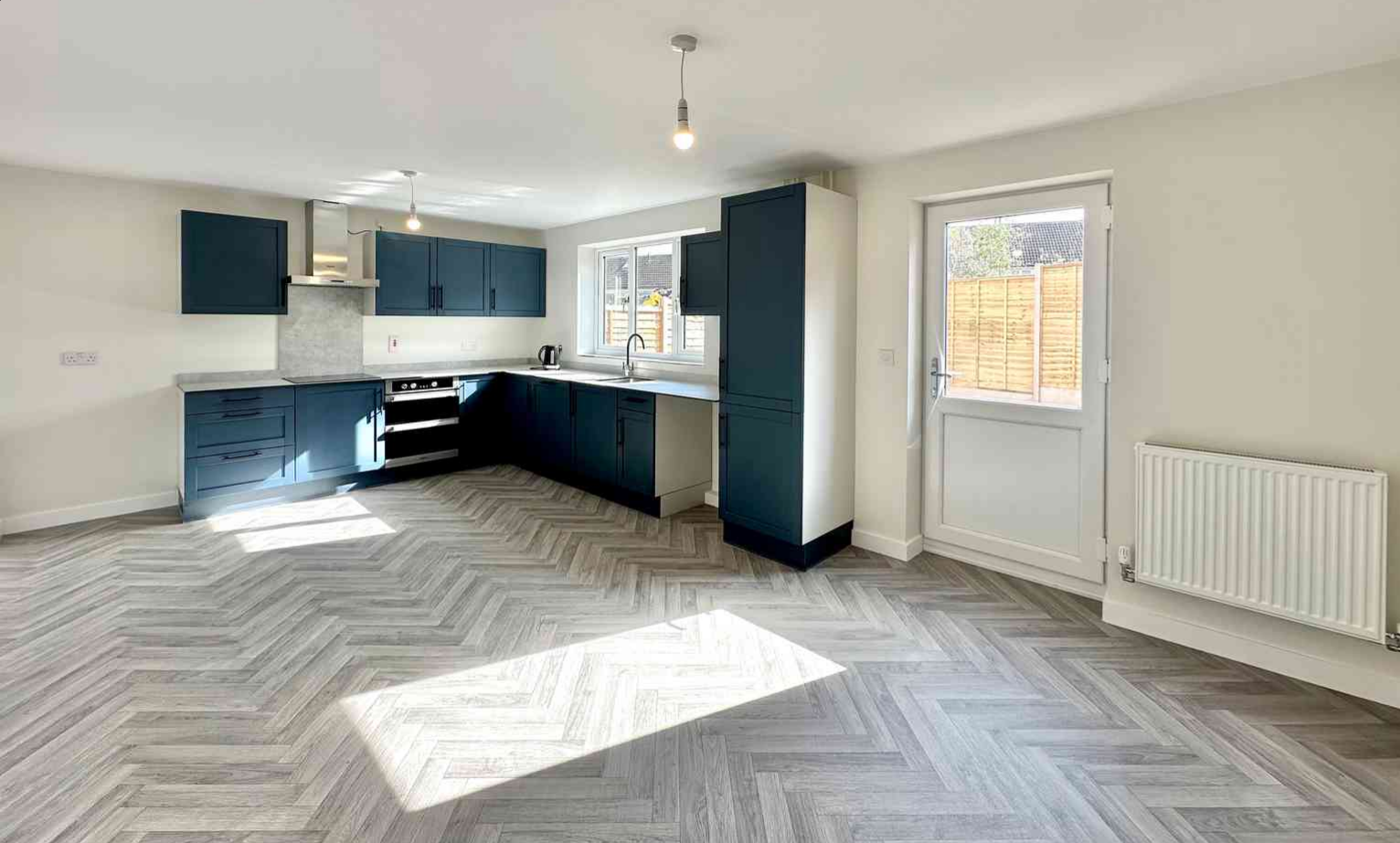
GROUND FLOOR 567 sq.ft. (52.7 sq.m.) approx.