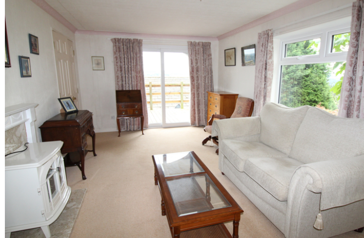
36 High Beck Park, Ilkley Road, Riddlesden, Keighley, West Yorkshire, BD20 5RE