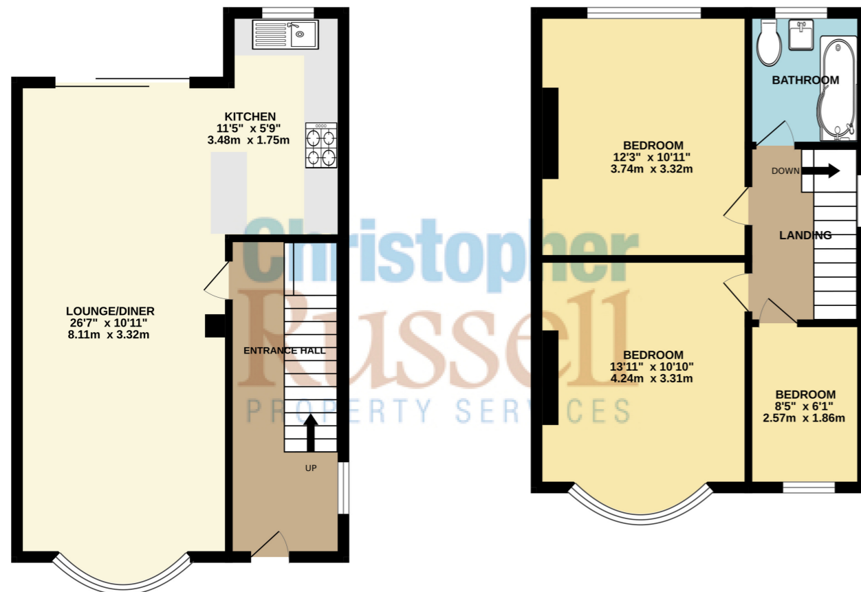
TOTAL FLOOR AREA : 831 sq.ft. (77.2 sq.m.) approx.

Whilst every attempt has been made to ensure the accuracy of the floorplan contained here, measurements of doors, windows, rooms and any other items are approximate and no responsibility is taken for any error, omission or mis-statement. This plan is for illustrative purposes only and should be used as such by any prospective purchaser. The services, systems and appliances shown have not been tested and no guarantee as to their operability or efficiency can be given. Made with Metropix ©2024