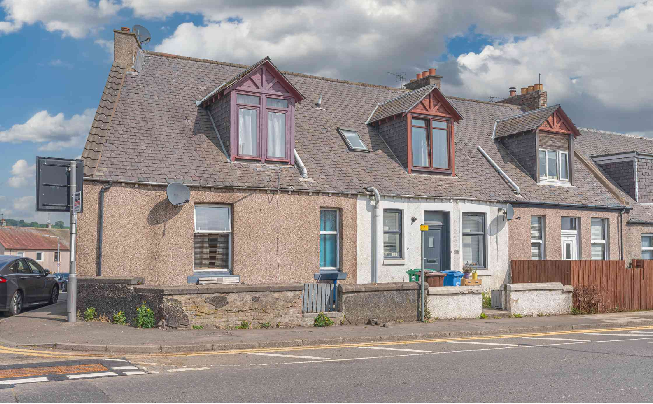
Offers Over £73,000 48 Dunfermline Road, Crossgates, Cowdenbeath, Fife, KY4 8AP