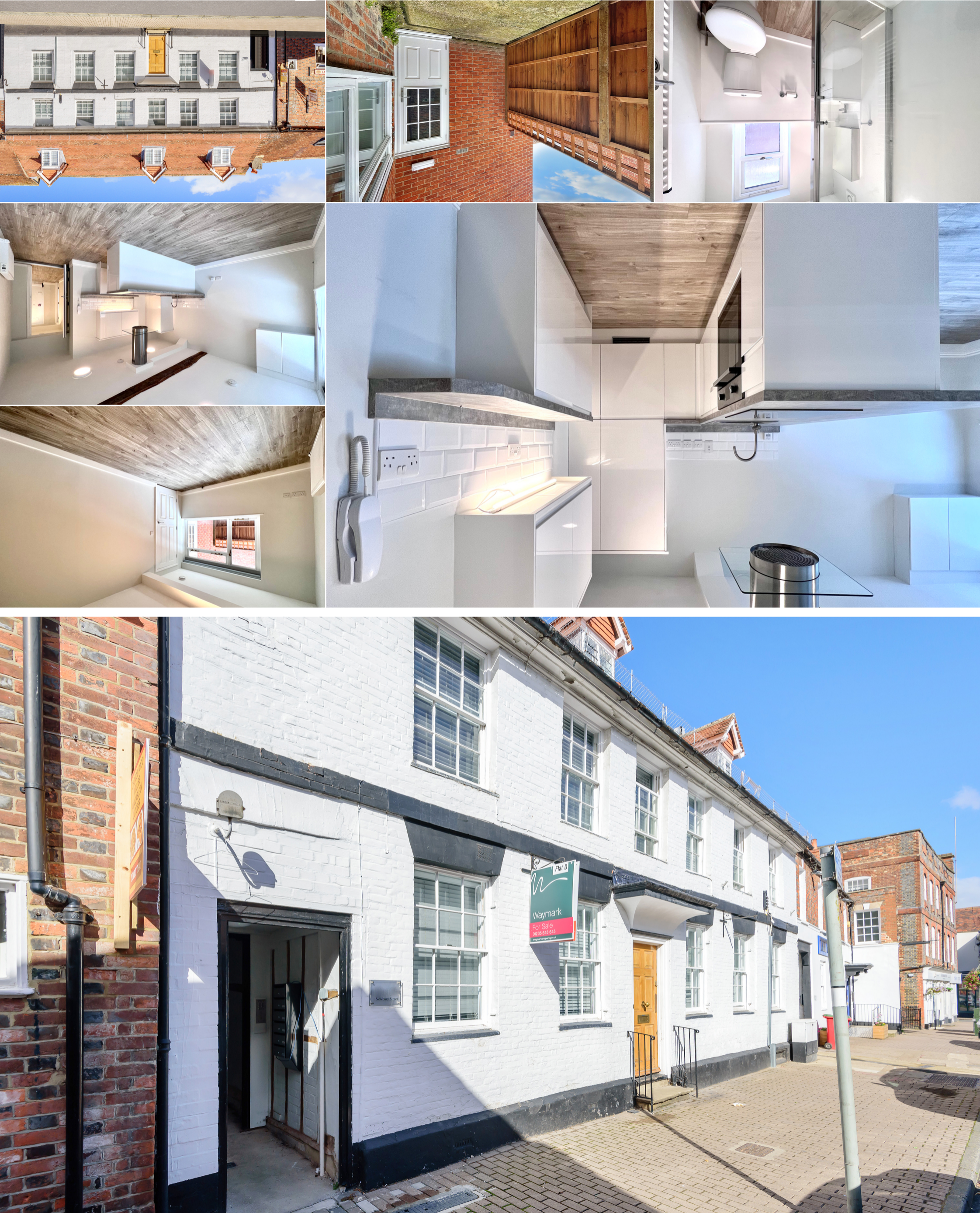
Flat D, 6 Newbury Street, Wantage OX12 8BS Oxfordshire, £142,500