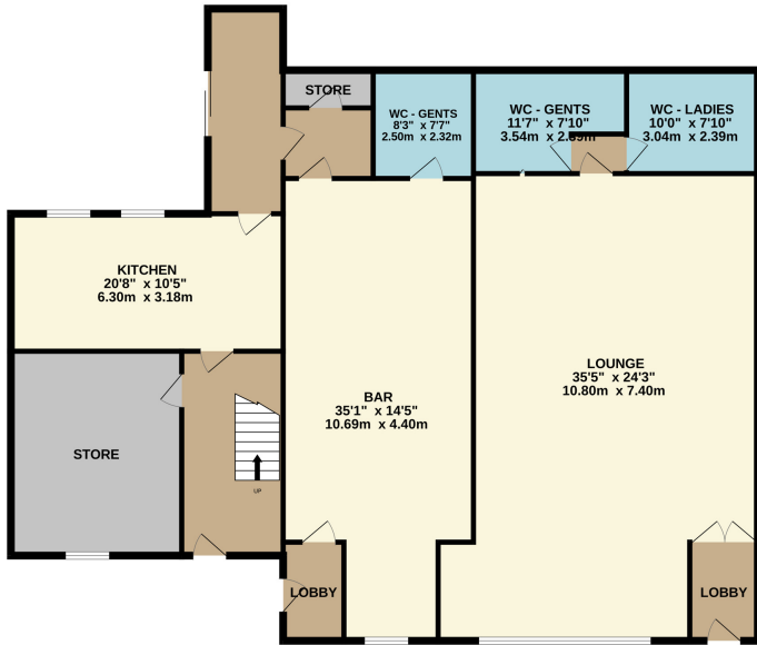
GROUND FLOOR 2184 sq.ft. (202.9 sq.m.) approx.