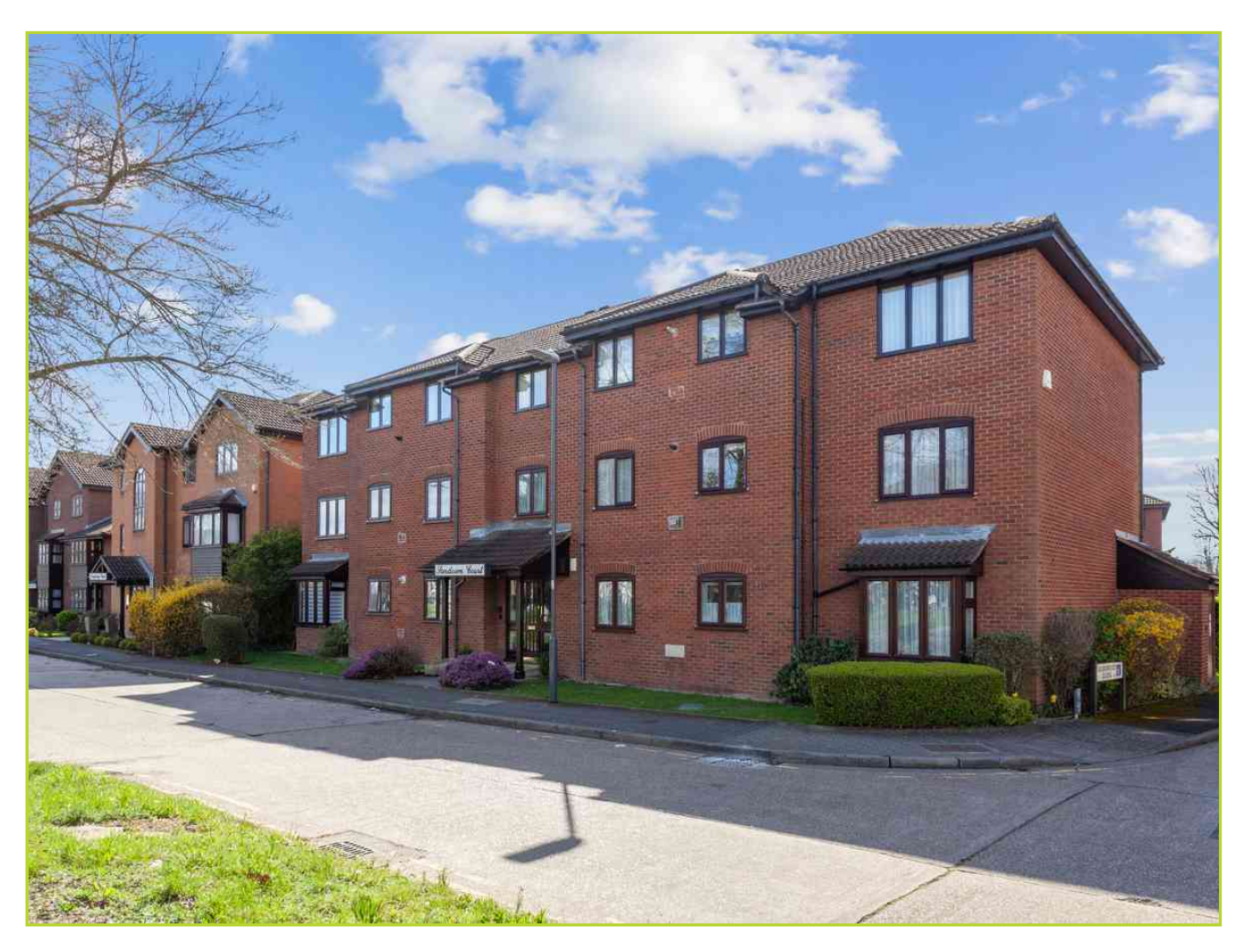
Sandown Court, Stanmore, Middlesex. HA7 4HZ. £500,000 Leasehold

This 2 bedroom 2 bathroom ground floor apartment offers spacious accommodation throughout with the benefit of residents parking, terrace, neatly presented communal grounds and a garage. The property is located off Marsh Lane with a short walk to Stanmore's shopping and transport facilities..