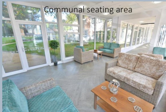
Communal seating area