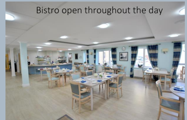
Bistro open throughout the day