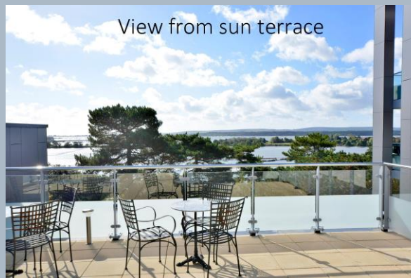
View from sun terrace