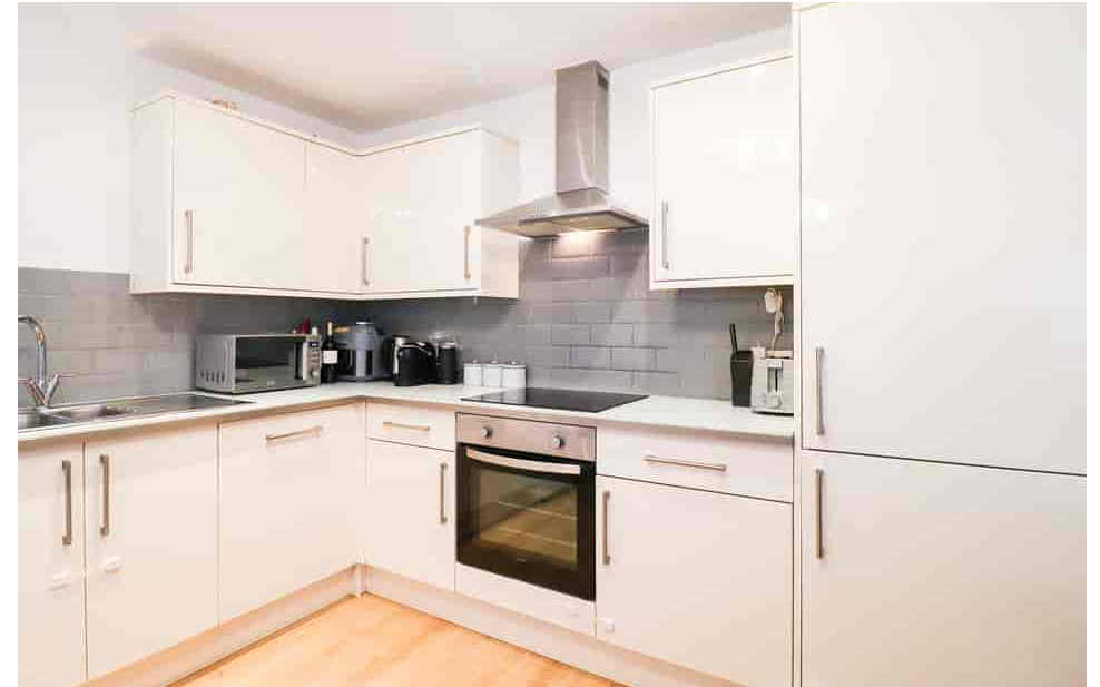
10 Park House Apartments, Kingsley Park Terrace, Northampton NN2 7HL Guide Price £150,000 -