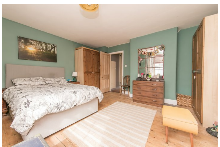
4.65m x 4.06m (15' 3" x 13' 4") Window to front, window to side, radiator, strip wood floor.