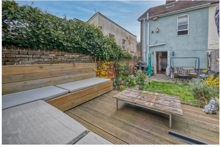
Enclosed by a red brick wall with lawn area, patio area, raised decking area, gated side access.