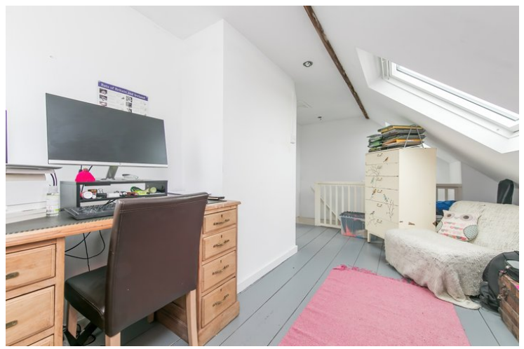
4.62m x 3.08m (15' 2" x 10' 1") Window to side, velux window, distant river views, wood flooring, radiator and door to: