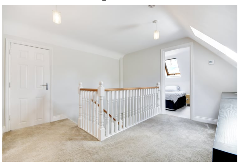
Skylight window facing the front aspect, door leading to large loft storage space.