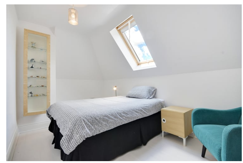
Skylight window facing the side aspect, radiator.