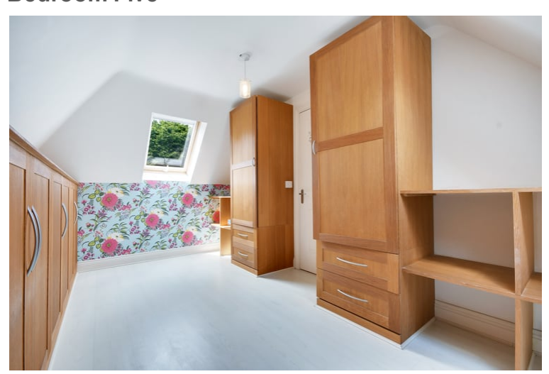
Skylight windows to the front and rear, extensive range of built in bedroom furniture.