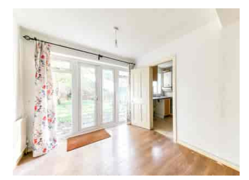
Galpins Road, Thornton Heath, Surrey, CR7 6EG £450,000