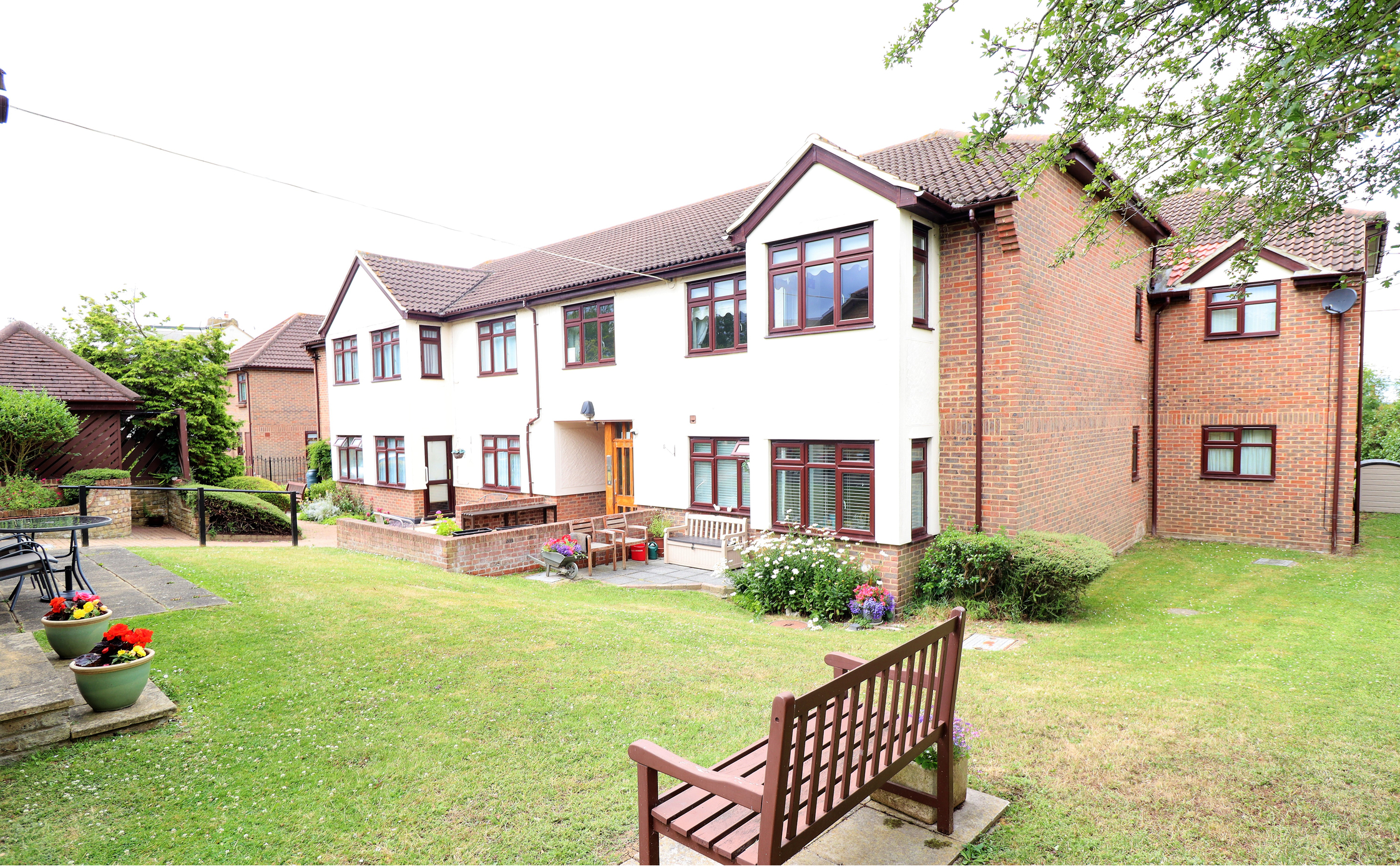
ACCOMMODATION 563 sq.ft. (52.3 sq.m.) approx.