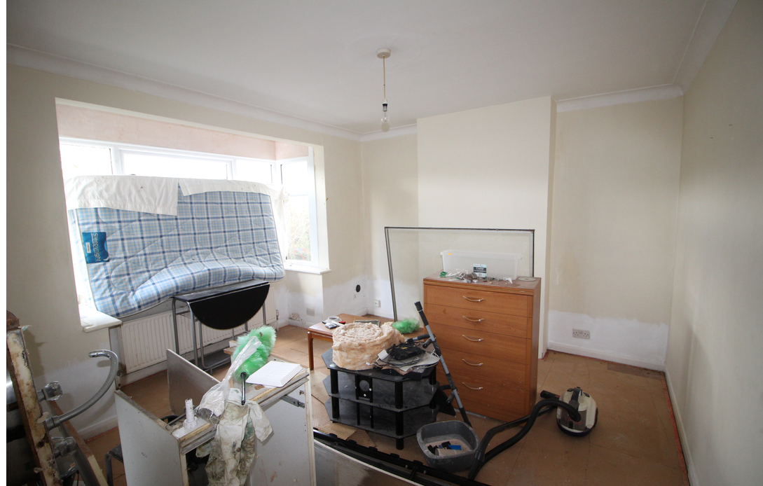
424 London Road, Ashford, Surrey TW15 3AB £250,000 - Leasehold