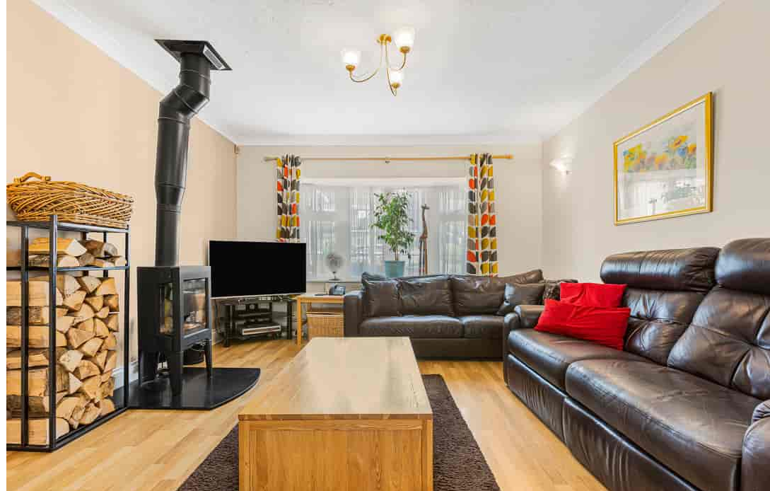
93 Marlow Bottom, Marlow, Buckinghamshire SL7 3NA Guide Price £950,000 - Freehold