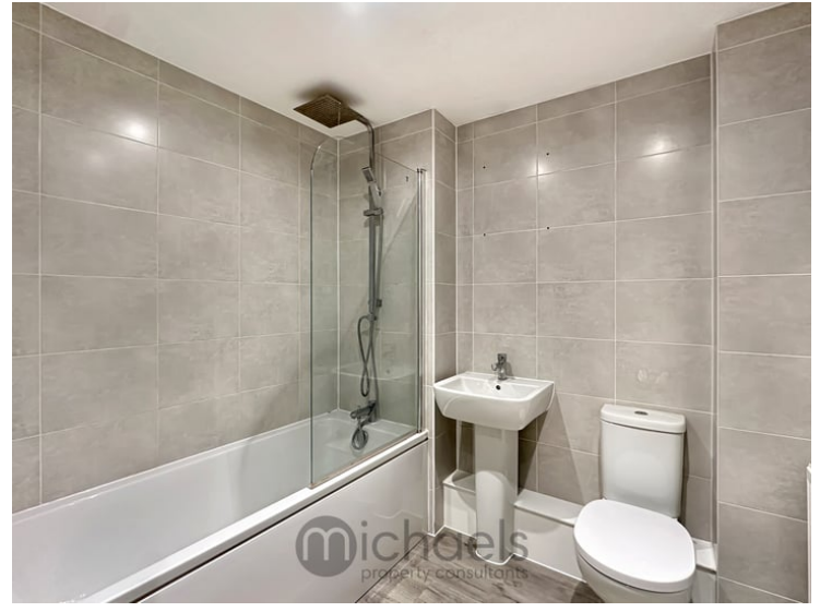
Panel enclosed bath, low level w.c., wash hand basin, part tiled walls, laminate flooring, radiator.