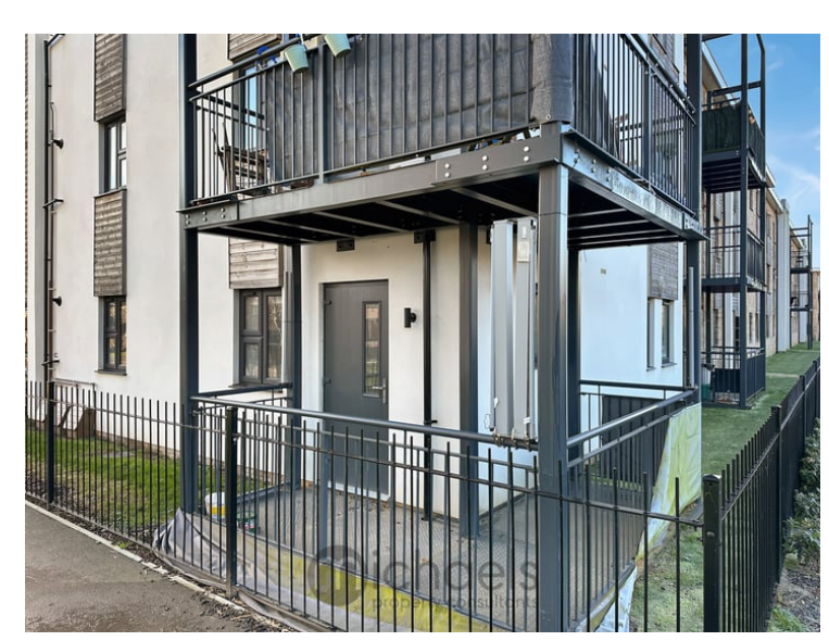
The apartment benefits from allocated parking for one vehicle. A communal bike store is also available.