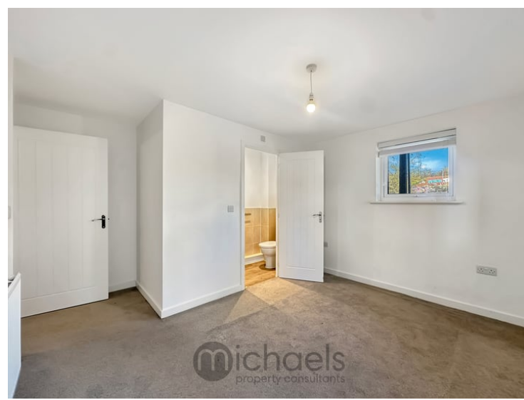
12' 9" x 11' 3" ( 3.89m max x 3.43m max )UPVC double glazed window to side, radiator, door to: