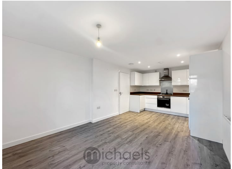
19' 8" x 9' 4" ( 5.99m max x 2.84m max ) Laminate flooring, range of modern matching base and eye level units, work surfaces, inset sink and drainer unit, integrated appliances, two radiators, UPVC double glazed windows to side and rear.