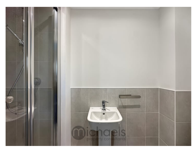
Shower cubicle, low level w.c., wash hand basin, part tiled walls, laminate flooring, radiator, upvc double glazed window to side.