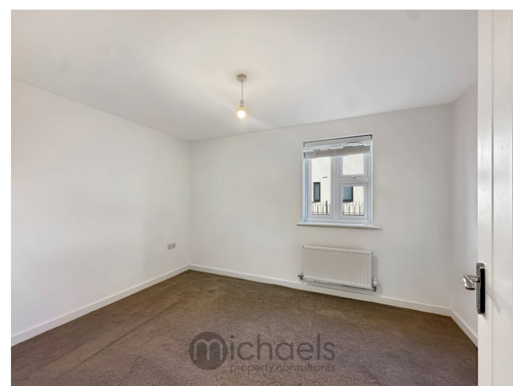
11' 9" x 9' 11" ( 3.58m x 3.02m ) UPVC double glazed window to front aspect, radiator.