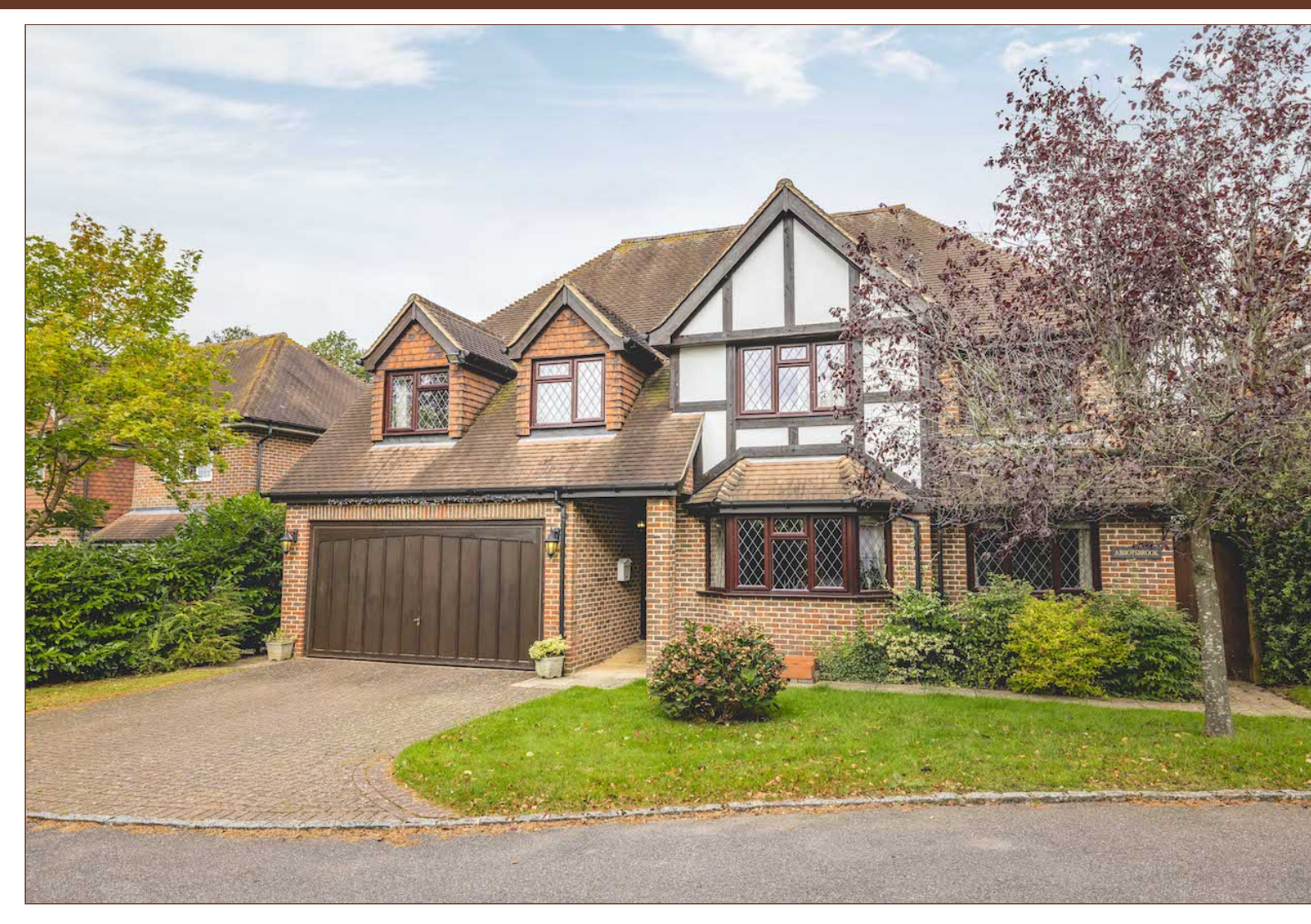
This delightful detached family home is offered for sale with NO ONWARD CHAIN. The spacious accommodation includes: five bedrooms, four reception rooms, four bathrooms (three en-suites), utility, cloakroom, double garage, driveway parking and good sized mature rear garden.

To the front of the property, driveway parking leads to the double garage and front door, there is an area of lawn and mature shrubs and trees giving privacy. The front door leads to the Hallway with access to all rooms including the integral double garage. There is a bright and spacious dual aspect Living Room with feature fireplace, engineered wood flooring throughout the downstairs and double doors leading to the garden. The Study, also with a garden aspect, is well fitted with a desk and shelving above and the Dining Room is accessed via double doors and looks over the front. There is a downstairs Cloakroom.