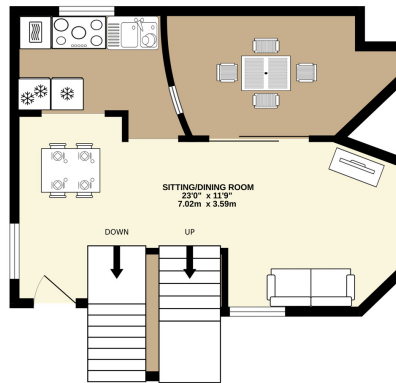
GROUND FLOOR 411 sq.ft. (38.2 sq.m.) approx.