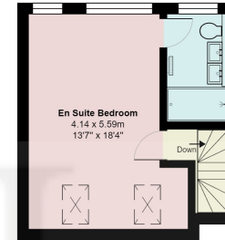
Second Floor Area: 28.7 m 2 ... 309 ft 2