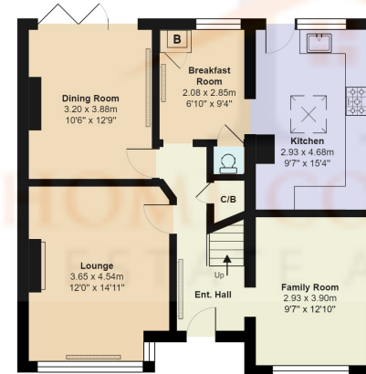
Ground Floor Area: 74.2 m 2 ... 799 ft 2