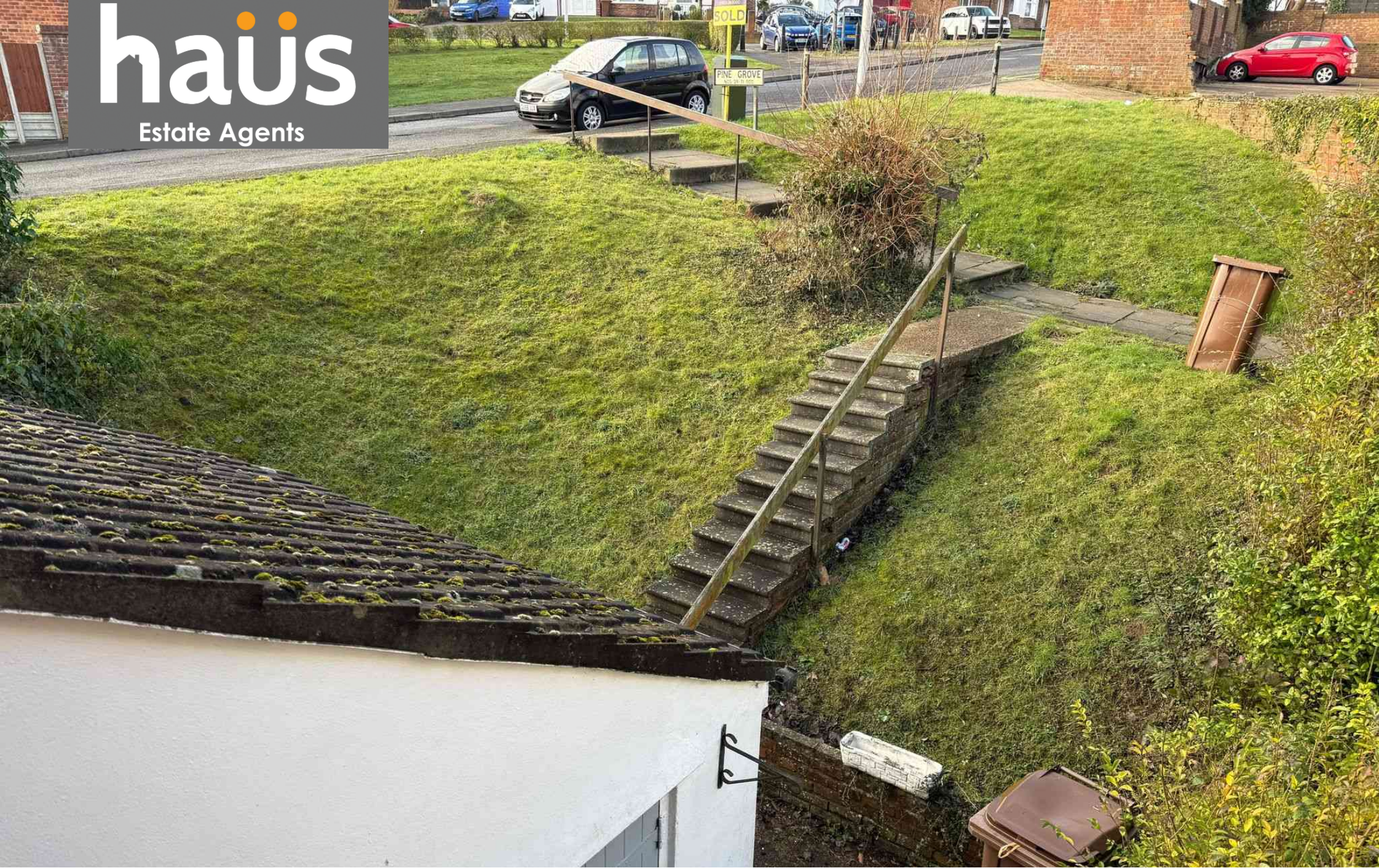
One Bedroom End of Terrace House Pine Grove, Gillingham, Kent, ME7 3QP