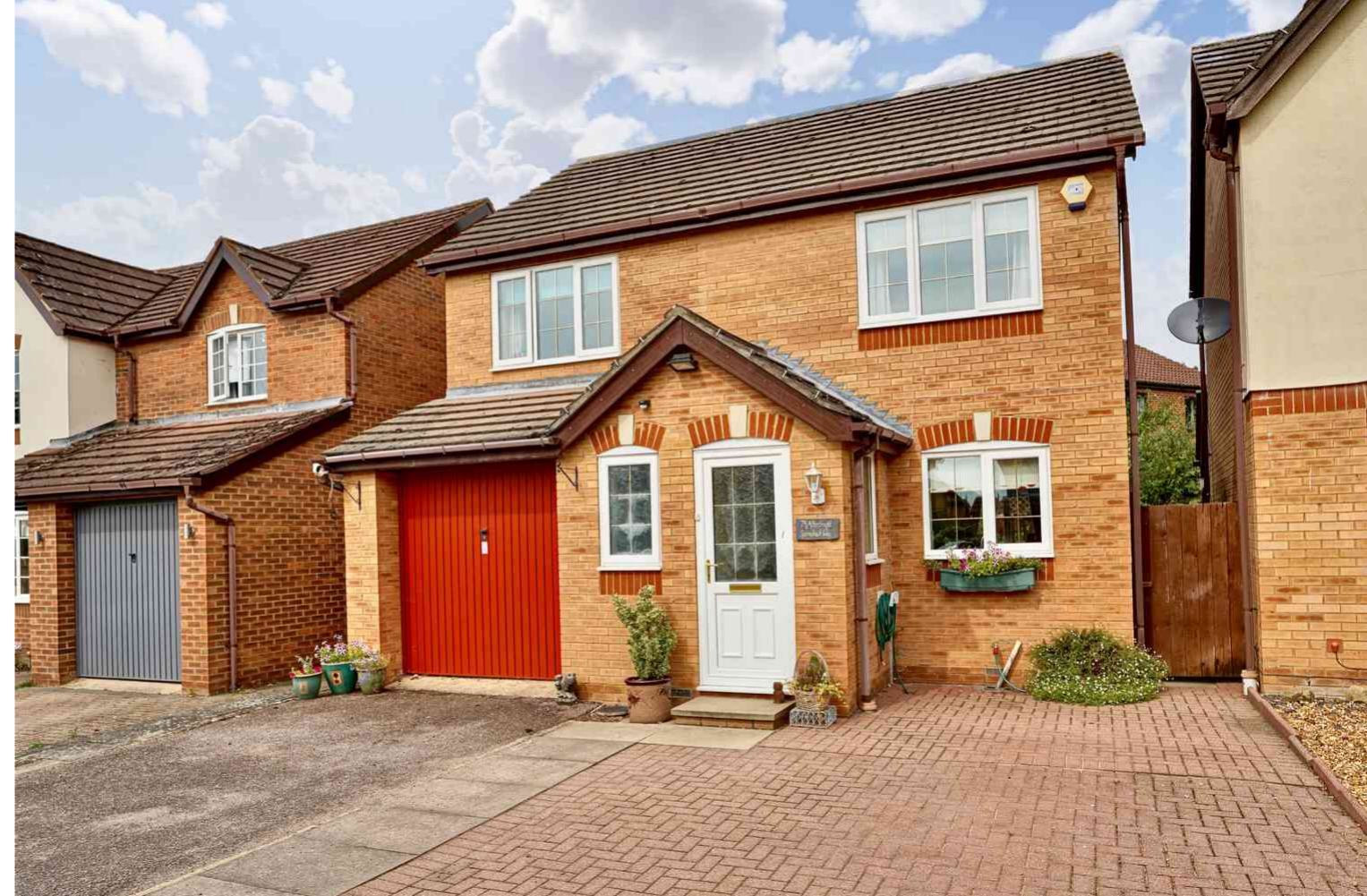
Sparrowhawk Way, Hartford PE29 1XE