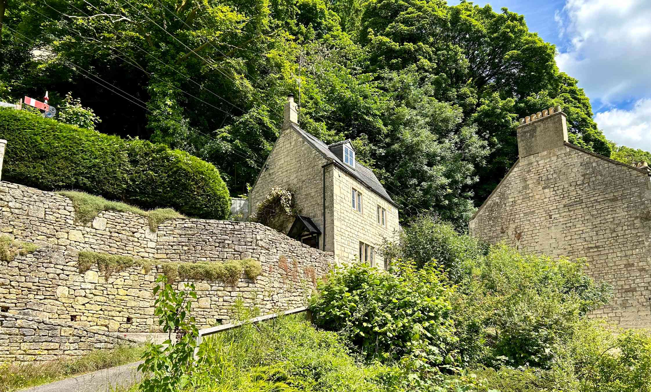
Fir Tree Cottage, St Marys, Chalford, Stroud, Gloucestershire, GL6 8PU Guide Price £420,000