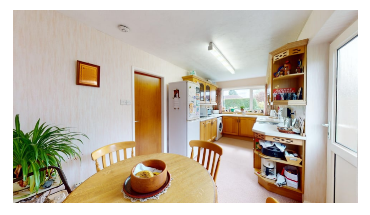
Open Plan Lounge and Dining Room