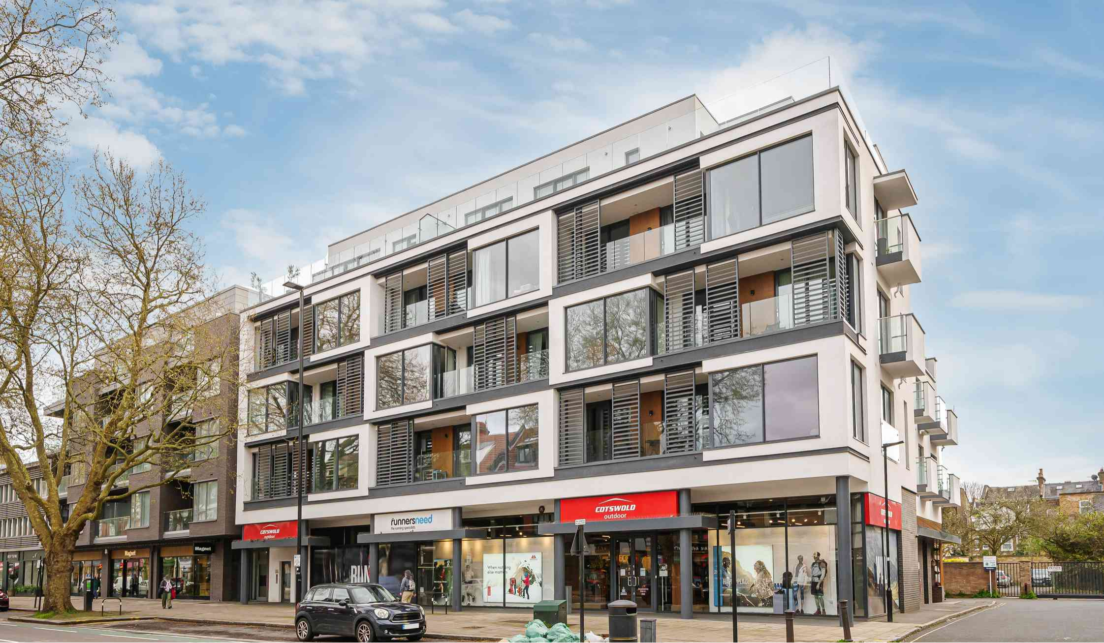
Chiswick High Road, London, W4 4HH