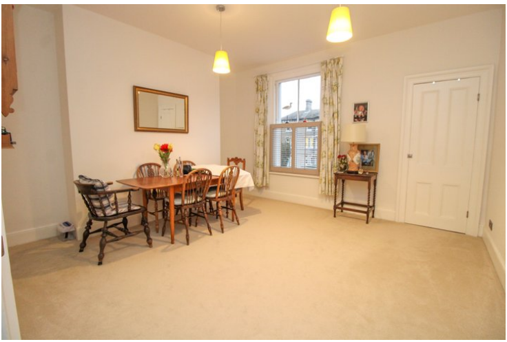
12' 11" x 12' 8" (3.94m x 3.86m) Window to front aspect with wooden shutters radiator, storage cupboard