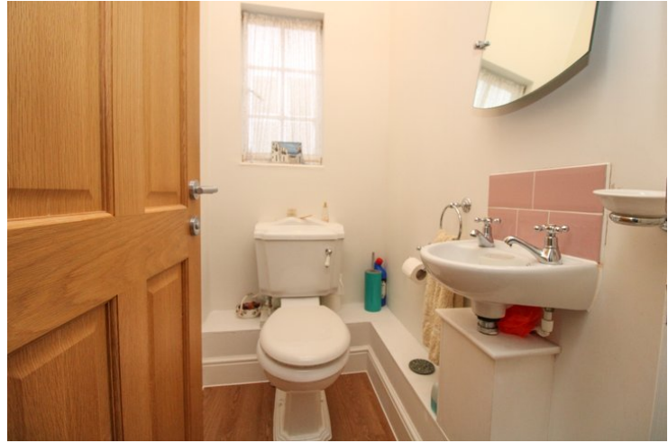
9' 7" x 2' 11" (2.92m x 0.89m) Wood flooring throughout, shower with tiled wall behind, low level W.C, wash hand basin, heated towel rail