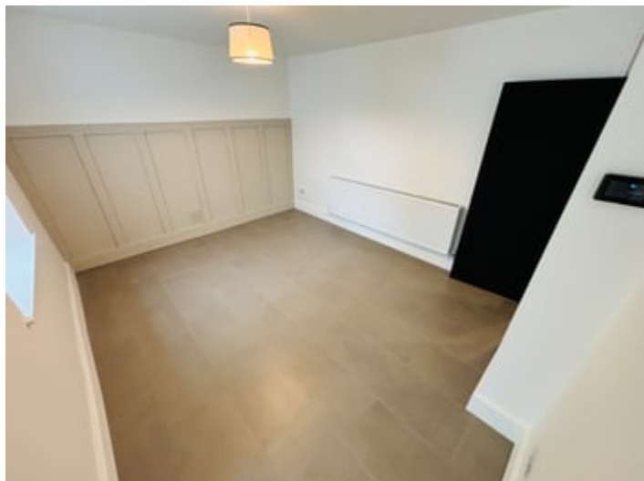
DINING ROOM (SECOND IMAGE)

12' 8" x 11' 2" (3.86m x 3.40m). With radiator, feature panelled wall, tiled flooring, brand new staircase to the first floor accommodation.