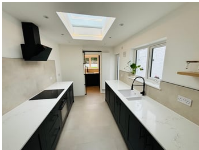
KITCHEN (SECOND IMAGE)

12' 3" x 8' 0" (3.73m x 2.44m). A Shaker carbon fitted kitchen with a range of wall floor units with Gold Marble Quartz over, under mounted sink with flexi mixer tap, integrated electric oven, 4 ring induction hob and extractor hood over, UPVC fully glazed rear entrance door, upright radiator.