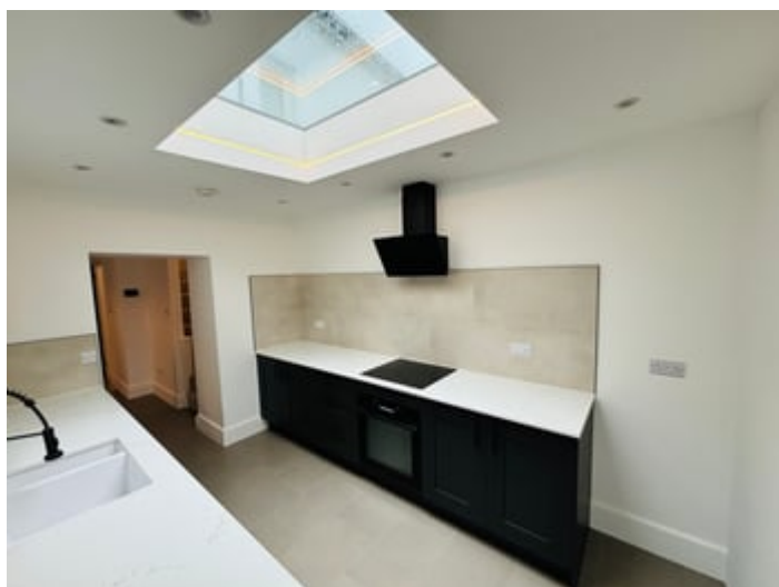
KITCHEN (THIRD IMAGE)