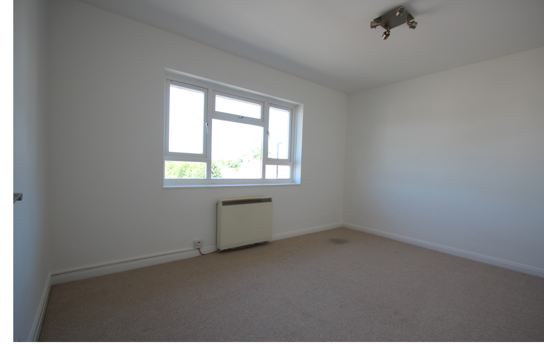
12 Dencliffe Church Road, Ashford, Surrey TW15 2PF £254,950 - Leasehold