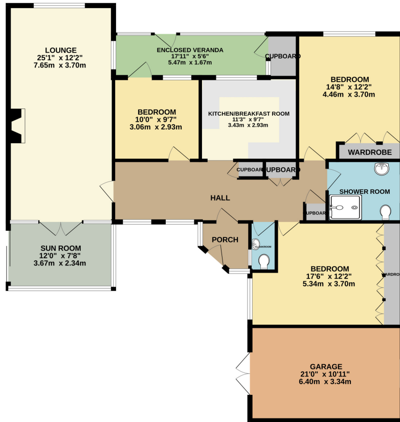
GROUND FLOOR 1465 sq.ft. (136.1 sq.m.) approx.