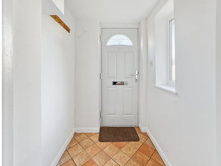
UPVC front door, tiled floor, window to side.