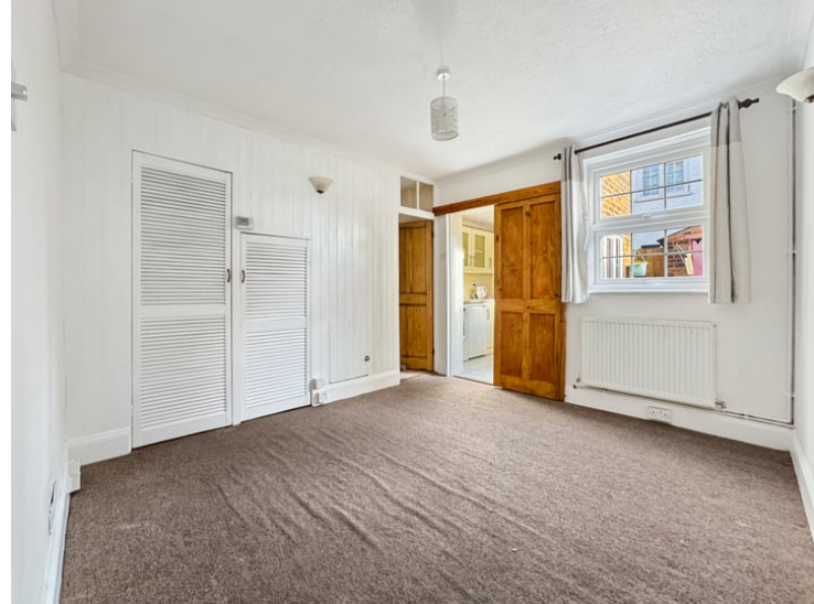
12' 7" x 11' 2" (3.84m x 3.40m) Window to rear, radiator, wall lights, under stairs storage, stairs to first floor.