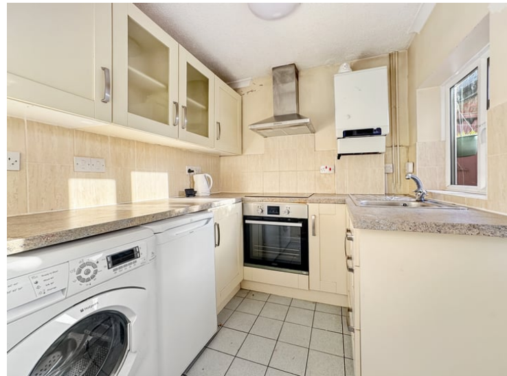
8' 1" x 6' 10" (2.46m x 2.08m) Double glazed window to side and UPVC door onto the courtyard, tiled floor, part tiled walls, wall mounted boiler, laminate worktop, range of wall and base units, stainless steel sink, integrated cooker, hob, cooker fan, space for washing machine, fridge/freezer,