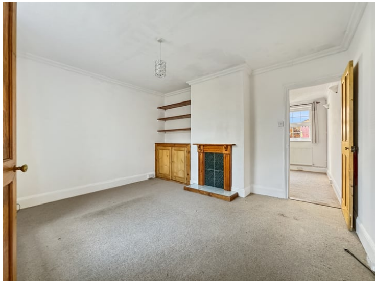
13' 0" x 11' 01" (3.96m x 3.38m) Double glazed window to front, radiator, fireplace, alcove unit.