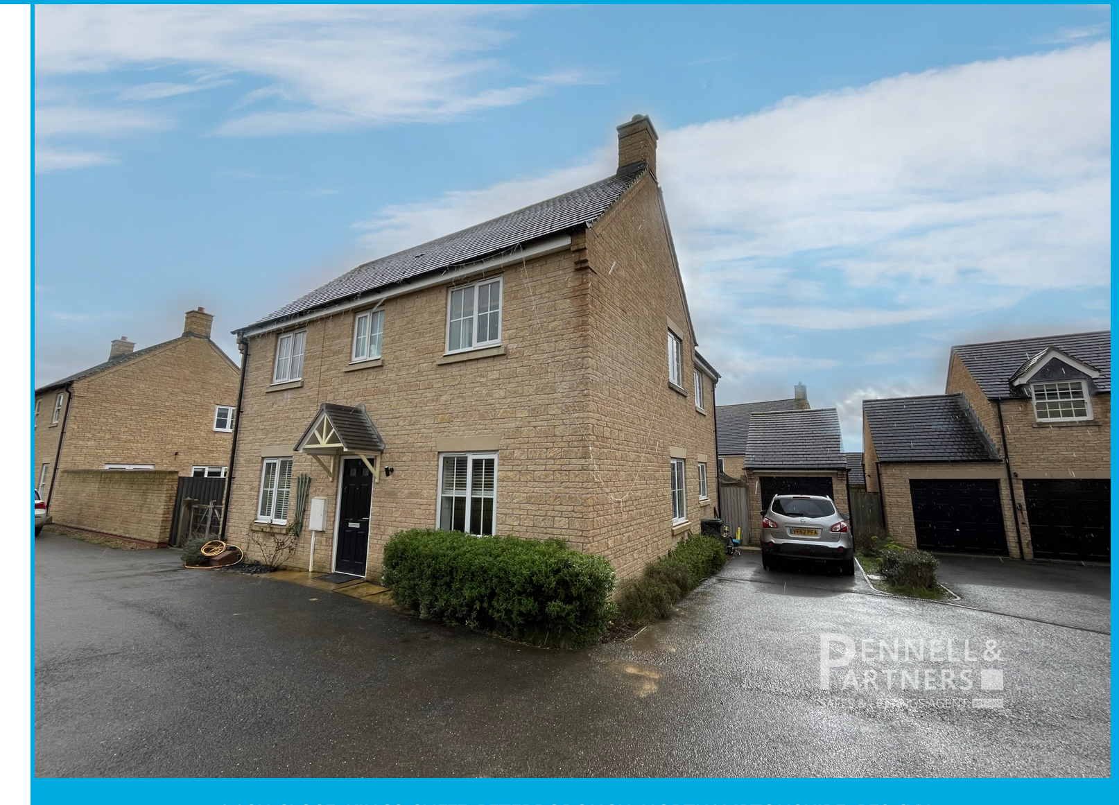
4 ASH CLOSE, KINGS CLIFFE, PETERBOROUGH, NORTHAMPTONSHIRE. PE8 6YX