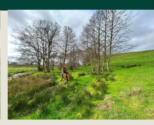
Guide Price -£25,000