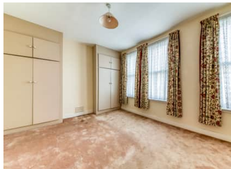
Upton Road, Thornton Heath, Surrey, CR7