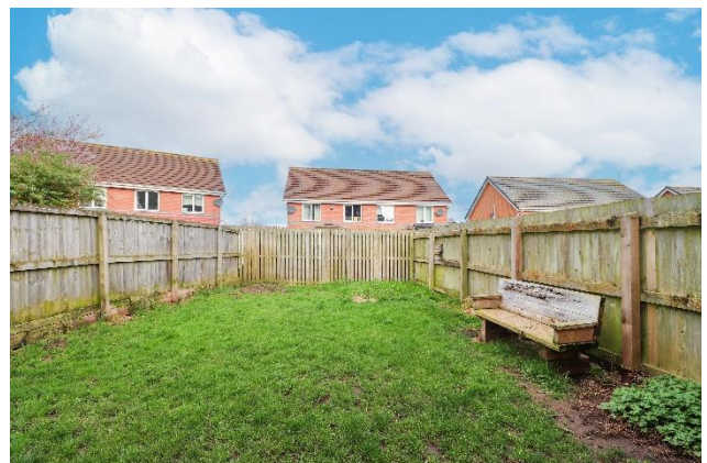
REAR OF THE PROPERTY & GARDEN