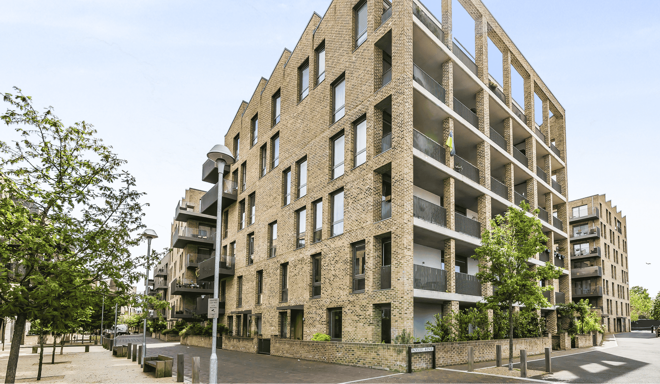
Isambard Court, Brentford, TW8 8FP