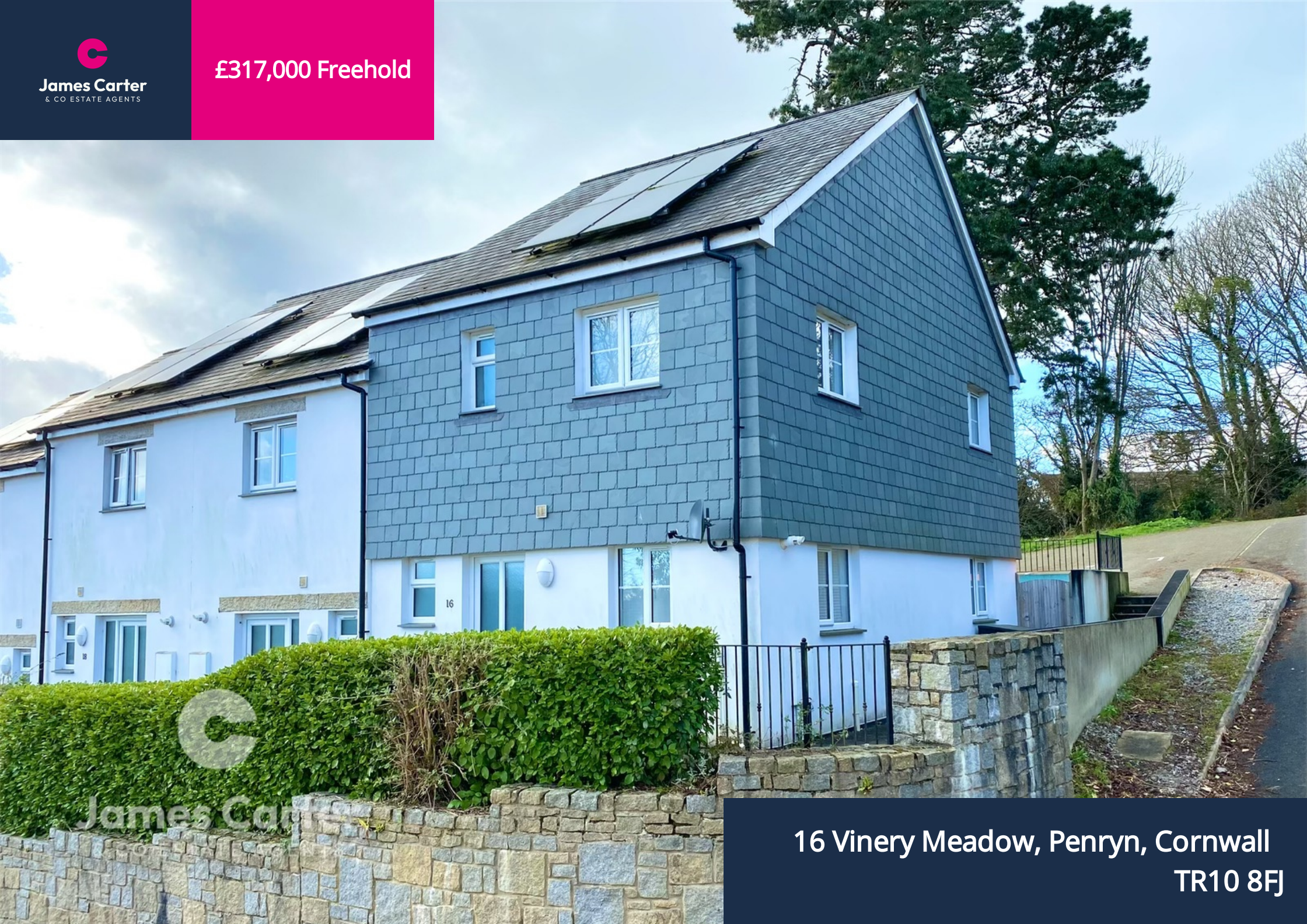
16 Vinery Meadow, Penryn, Cornwall TR10 8FJ