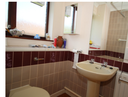
5 The Maltings, Norton Road, Letchworth Garden City, Hertfordshire, SG6 1AR