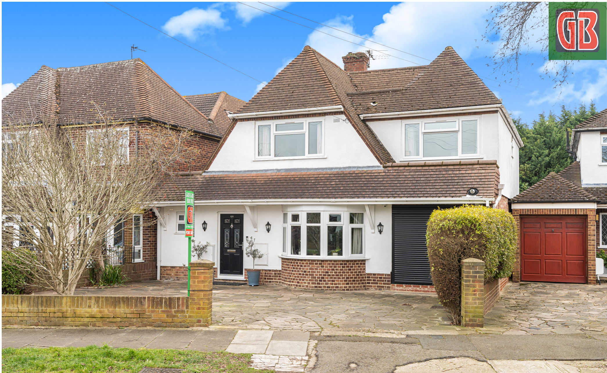
131 Grosvenor Road, Staines-upon-Thames, Surrey. TW18 2RP. 4 Bedroom Detached House - £950,000 Freehold