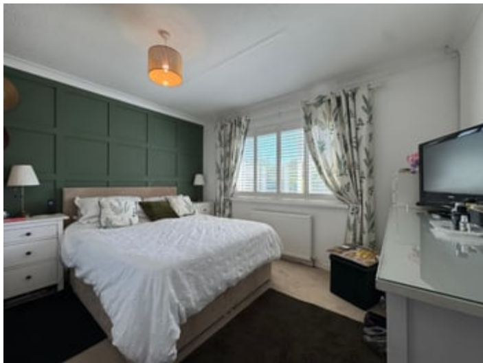
11' 9" x 11' 3" (3.58m x 3.43m) a double bedroom, window to rear overlooking garden area with distant country views, multiple sockets, radiator.