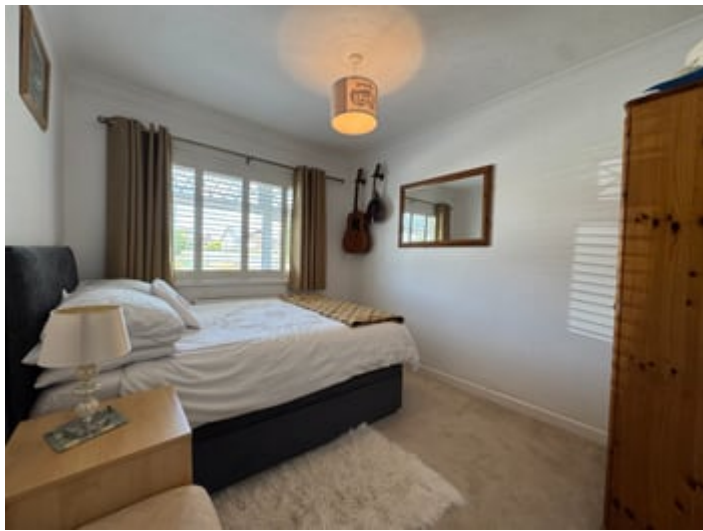
10' 9" x 8' 7" (3.28m x 2.62m) a double bedroom, window to front, multiple sockets, radiator.