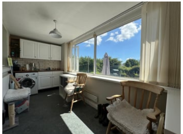
6' 5" x 14' 4" (1.96m x 4.37m) with a range of base and wall units, 1½ stainless steel sink and drainer with mixer tap, washing machine connection point, rear window to garden. Connecting door into kitchen.