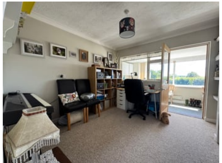
10' 7" x 9' 8" (3.23m x 2.95m) providing potential bedroom space with fitted double airing cupboard, window and door to -