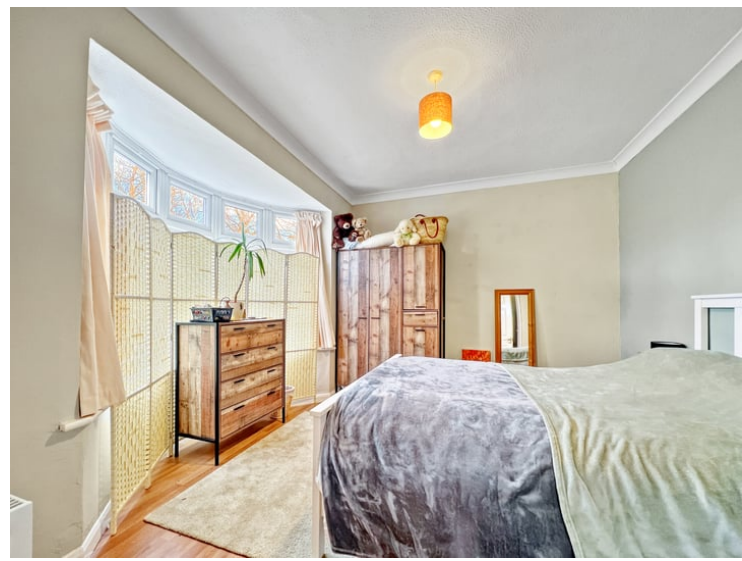
12' 5" x 12' 3" (3.78m x 3.73m)