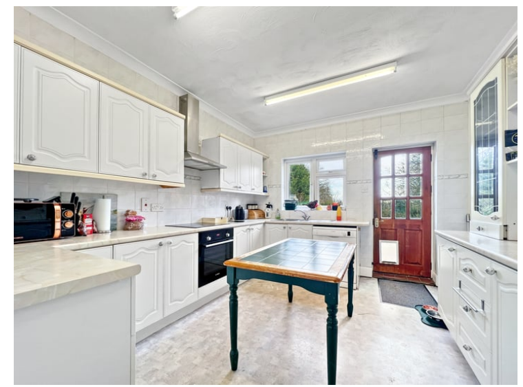
18' 6" Max x 10' 9" Max (5.64m x 3.28m)