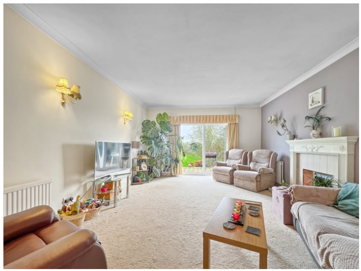
17' 6" x 13' 6" (5.33m x 4.11m)