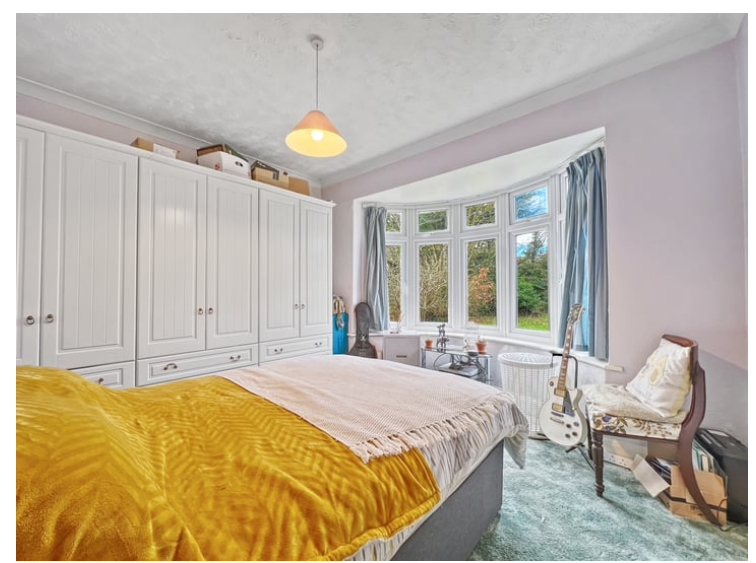
12' 6" x 12' 3" (3.81m x 3.73m)