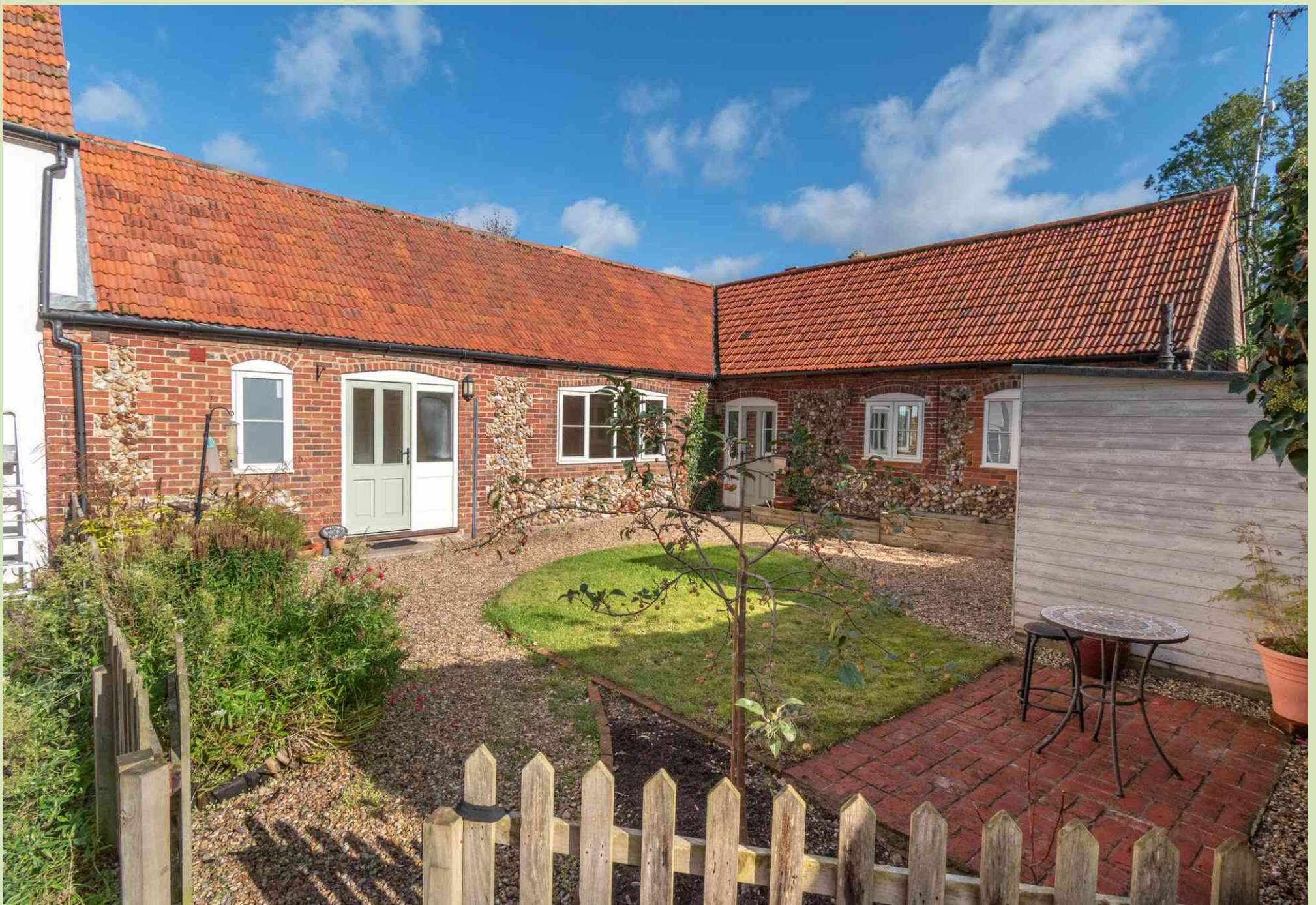
Stable Cottage, West Raynham Guide Price £325,000