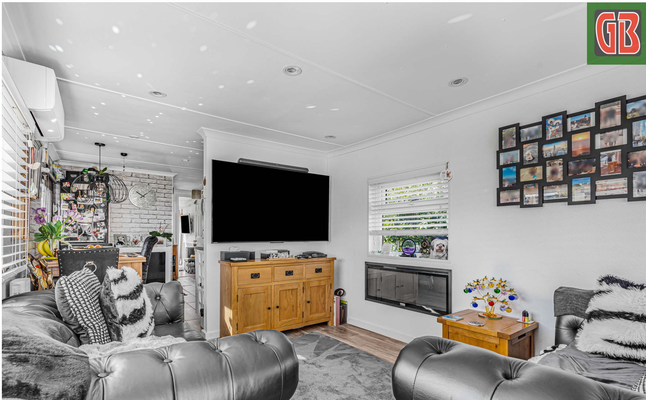
12 Rose Park, Addlestone, Surrey. KT15 1HN. 1 Bedroom Park Home - £150,000 OIEO Leasehold