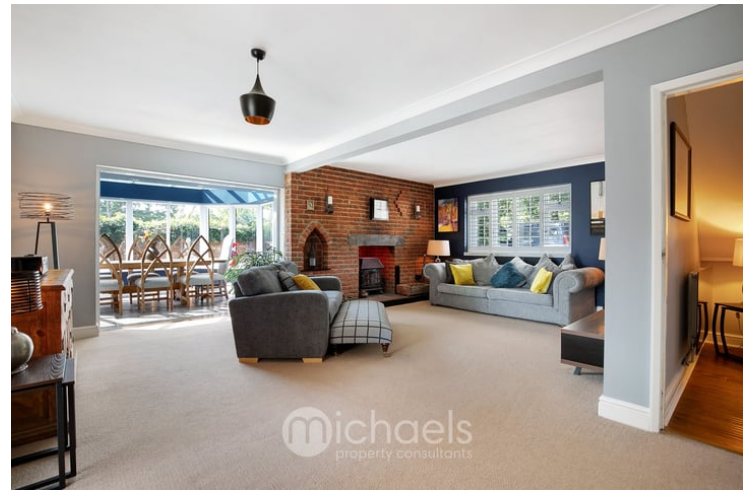
21' 1" x 18' 2" (6.43m x 5.54m)