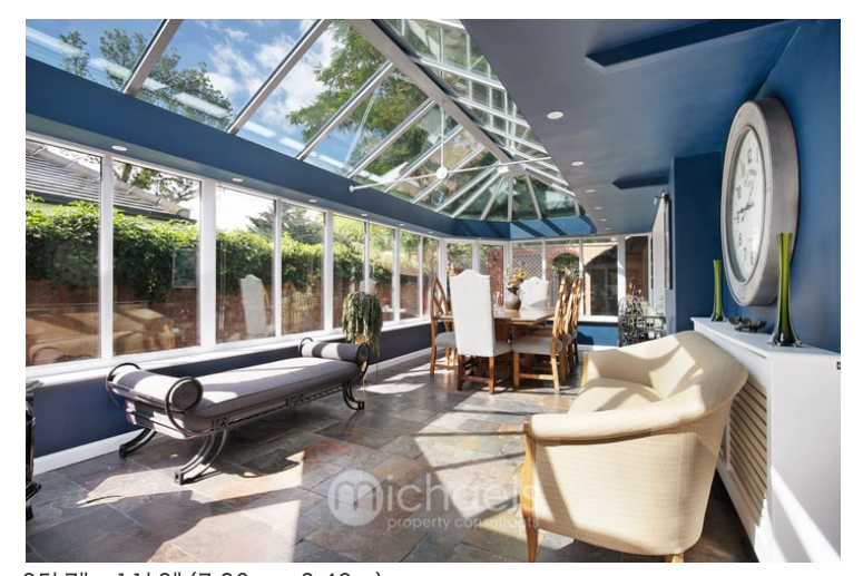
25' 7" x 11' 2" (7.80m x 3.40m)