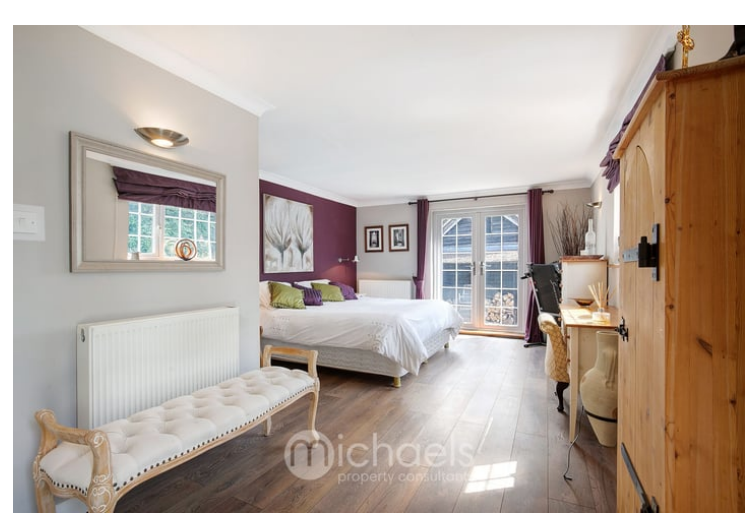
22' 2" x 12' 6" (6.76m x 3.81m)