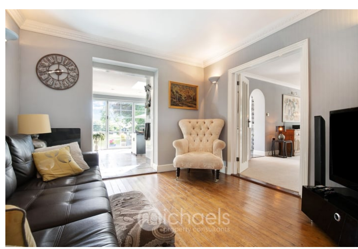
11'1" x 11'8" (3.38m x 3.56m)