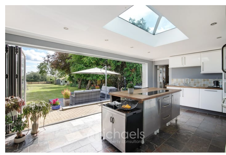
20' 11" x 12' 0" (6.38m x 3.66m)