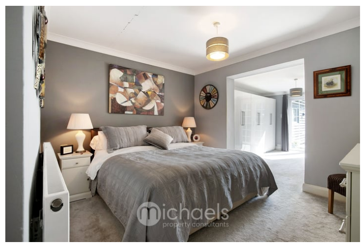
11'10" x 10'4" (3.61m x 3.15m)