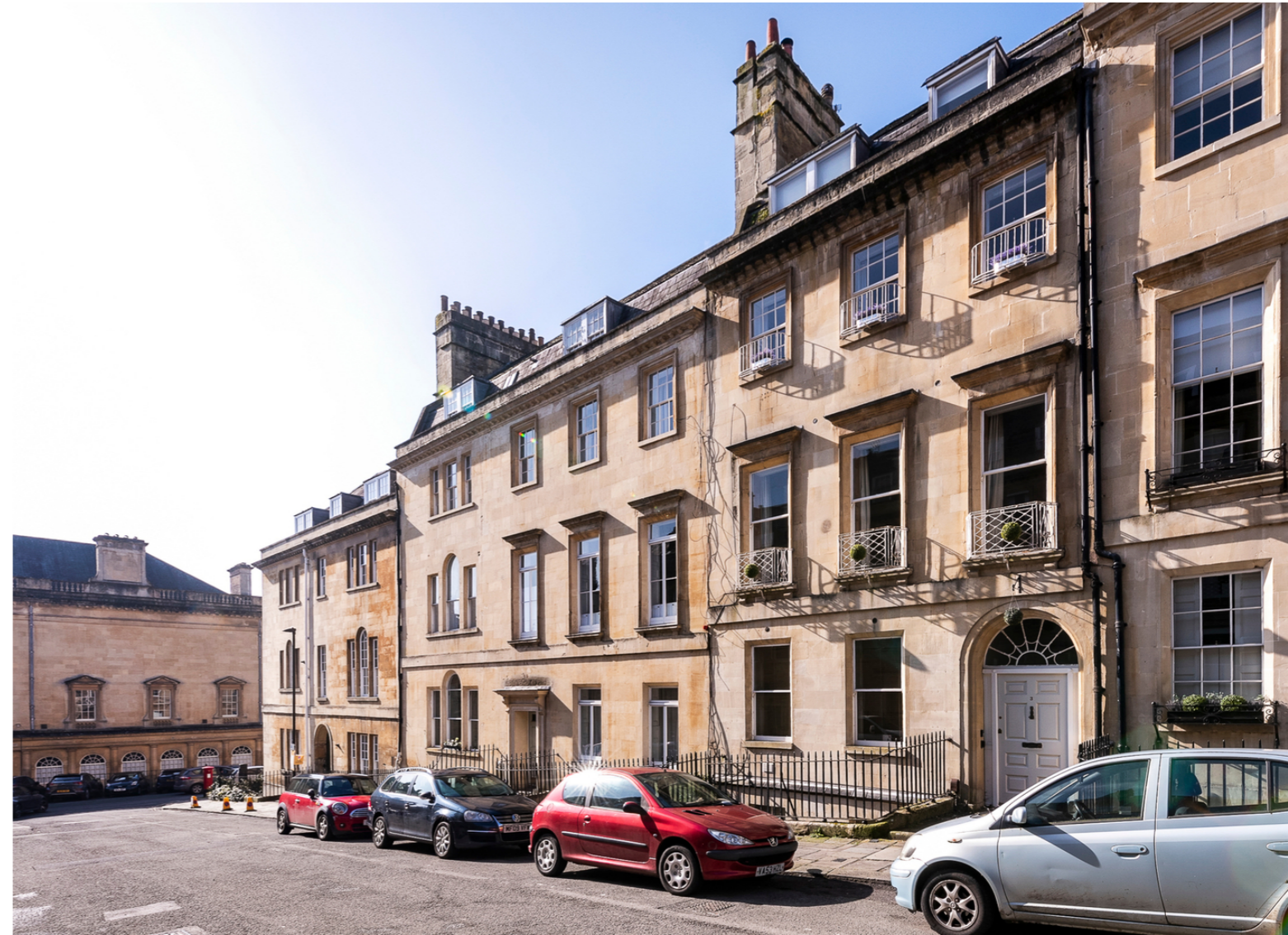
Russell Street, Bath