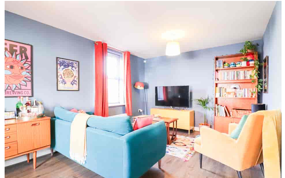
Rollers Close, Duston, Northampton NN5 6GZ Offers Over £320,000 - Freehold