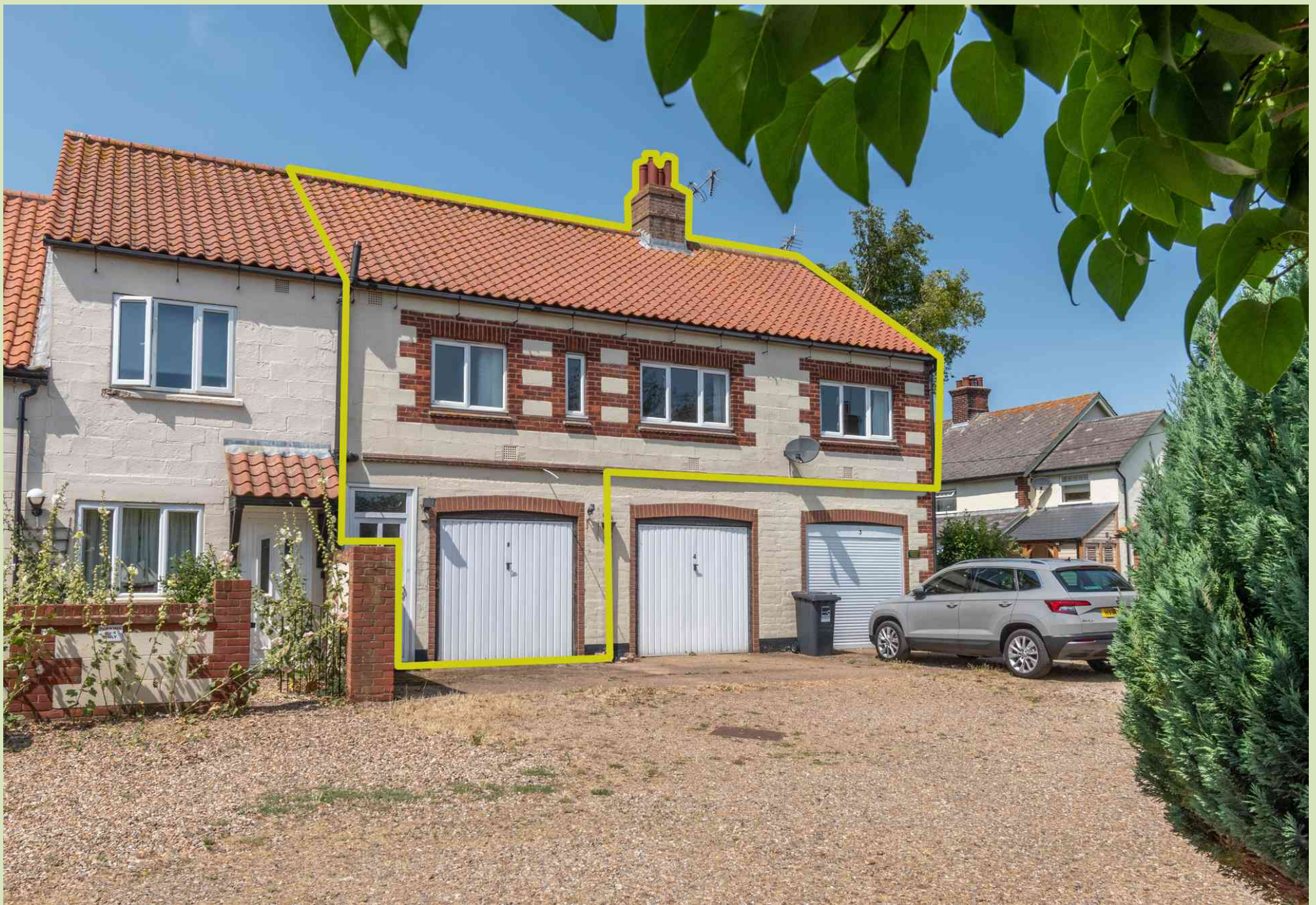
5 Claxtons Yard, Wells-next-the-Sea Offers in Excess of £300,000