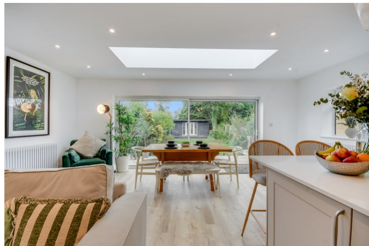
6.24m x 5.95m (20' 6" x 19' 6")