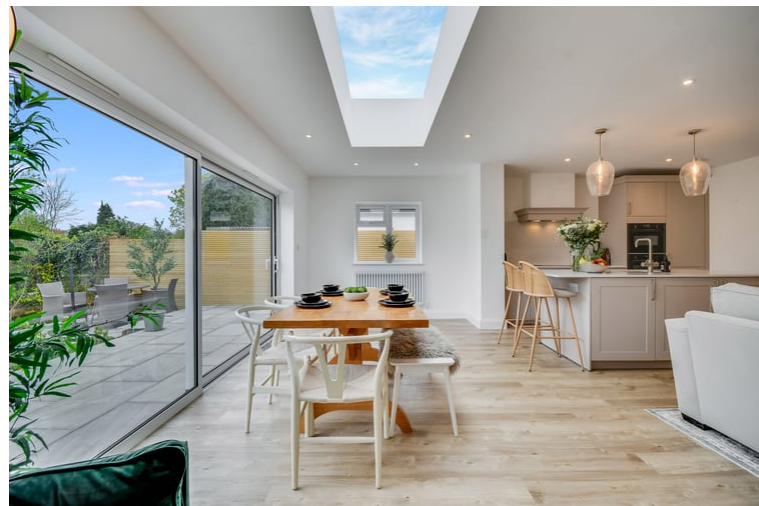
Open Plan Kitchen / Living Area