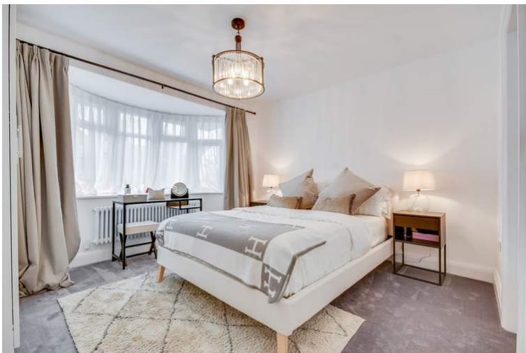
3.56m x 3.71m (11' 8" x 12' 2")