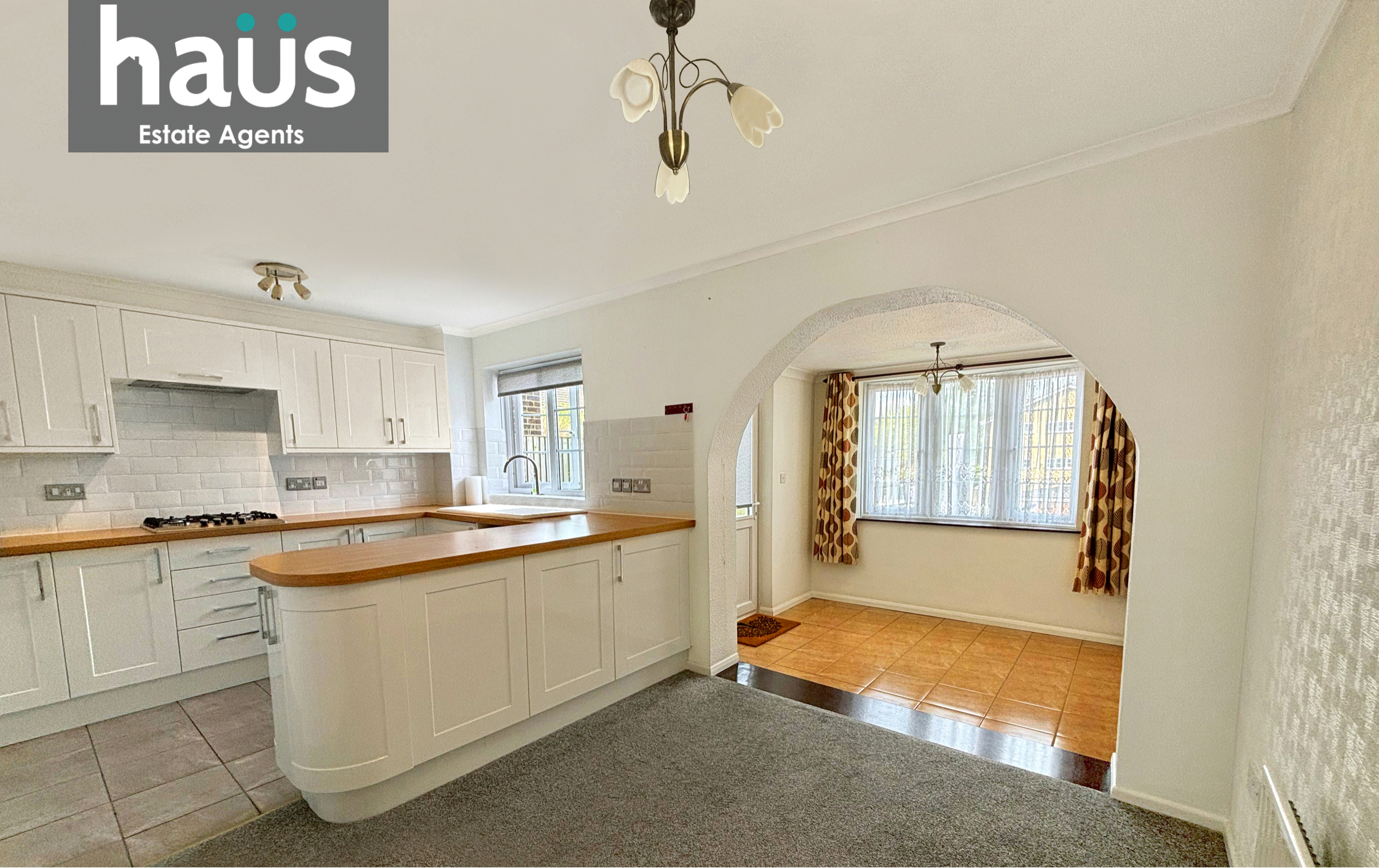
Three Bedroom Terraced House Wheatcroft Grove, Rainham, Gillingham, Kent, ME8 9JE