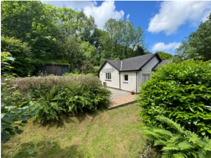
GROUNDNS (SECOND IMAGE)

In all a desirable property deserving early viewing and a totally rare opportunity within the Town.