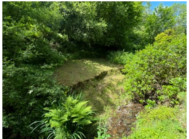
GROUNDNS (FIFTH IMAGE)