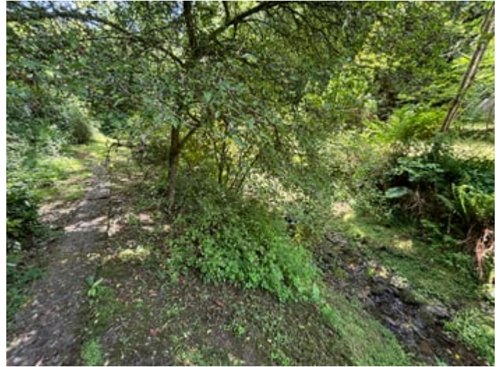
GROUNDNS (FOURTH IMAGE)